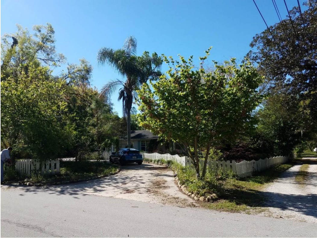
Adjacent lot across Hillwood Road