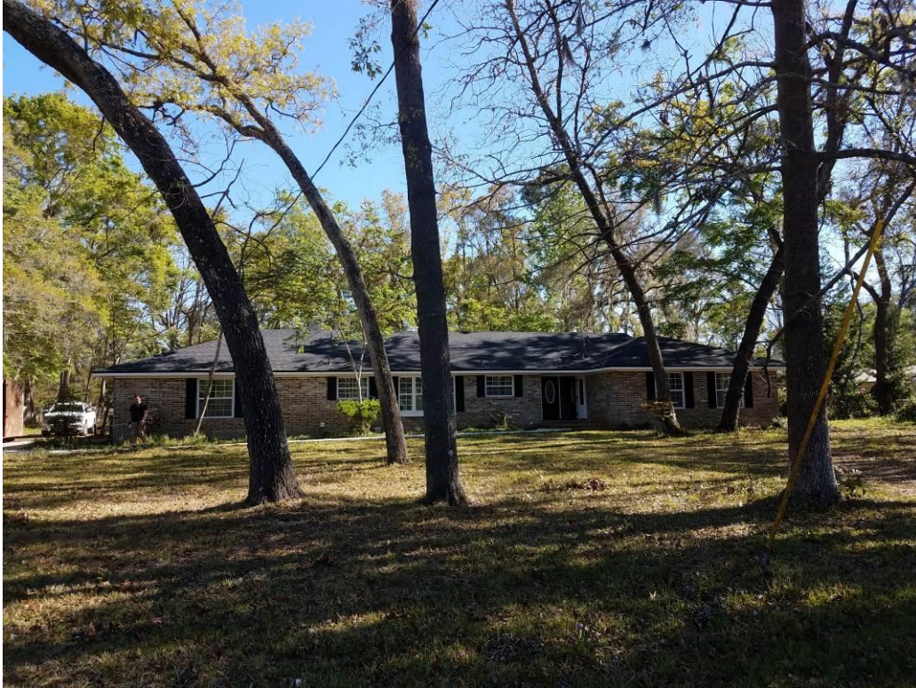
Existing home, viewed from Hillwood Road