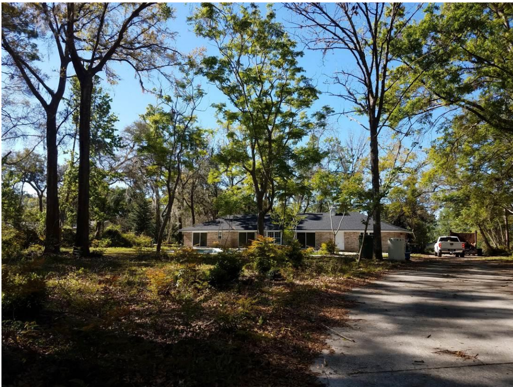
Existing home, viewe from Julington Creek Road