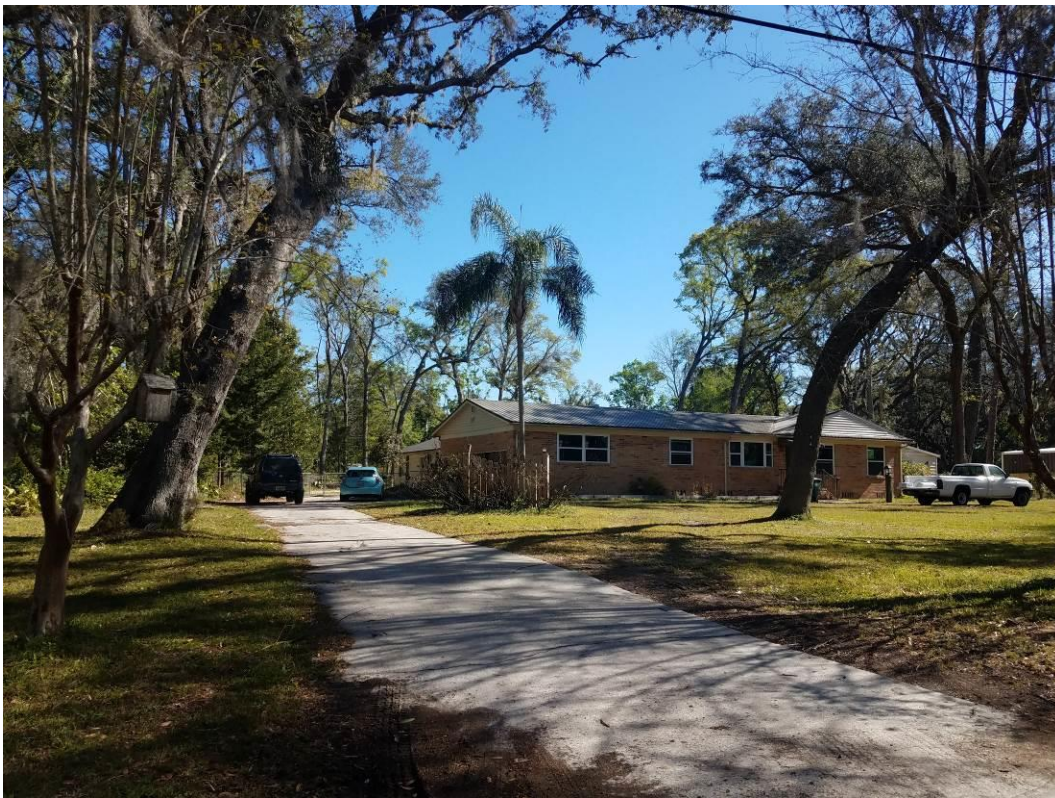
Adjacent single-family home